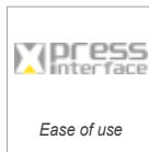
Ease of use